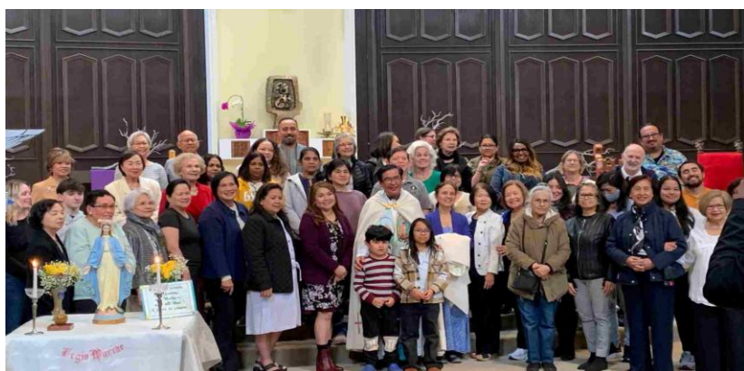
Newsnotes/JA/Aug 2025, pg. 3